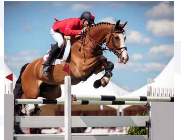
I adore the Devon Horse Show.