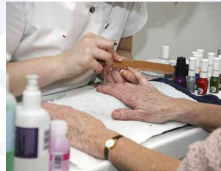
My salon is still only minutes away.