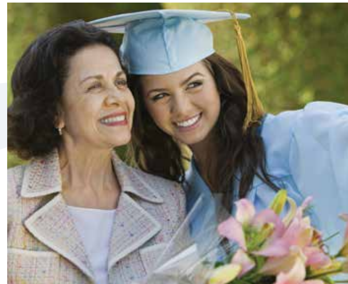
So proud of my granddaughter.

Daylesford Crossing keeps you connected to the community you love and the friends and family you cherish, while building new friendships at a place you'll be proud to call home.